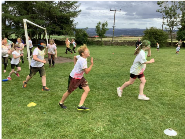
Modeshift Stars Award